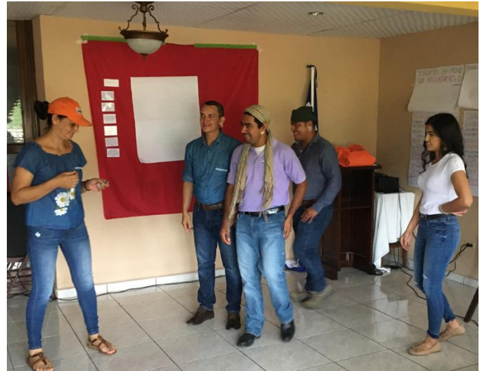
Participants learn about the roles of men and women in rural Honduras through a role-play exercise.