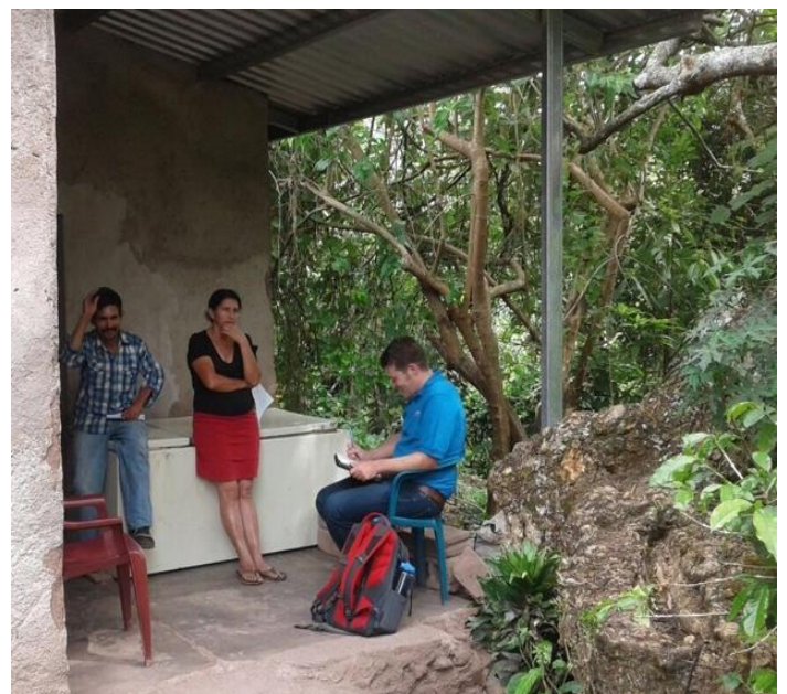
Homewood conducting an interview with a couple in Lempira, Honduras