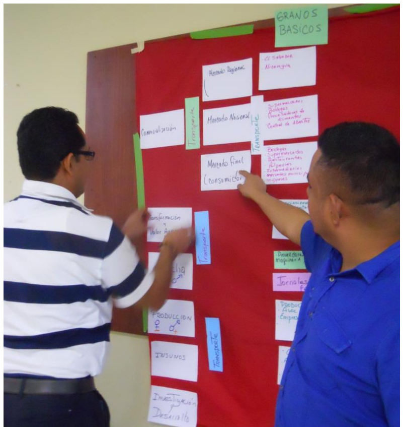
Participants integrating gender in the value chain