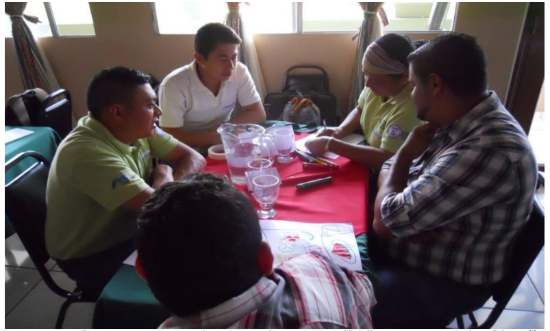
Participants working on the session “What goes on the Plate”

There will be a follow up activity in November with all workshop participants to assess how they have used the knowledge and skills gained in the workshops.