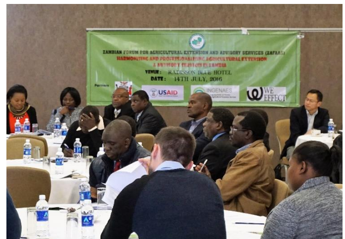
Stakeholders at a NAESS meeting in July 2016

This strategy, four years in the making, is a major step towards achieving food and nutrition security and helping Zambians rise out of poverty.