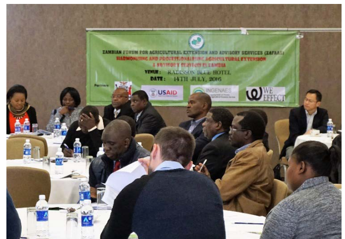
Stakeholders at a NAESS meeting in July 2016

This strategy, four years in the making, is a major step towards achieving food and nutrition security and helping Zambians rise out of poverty.