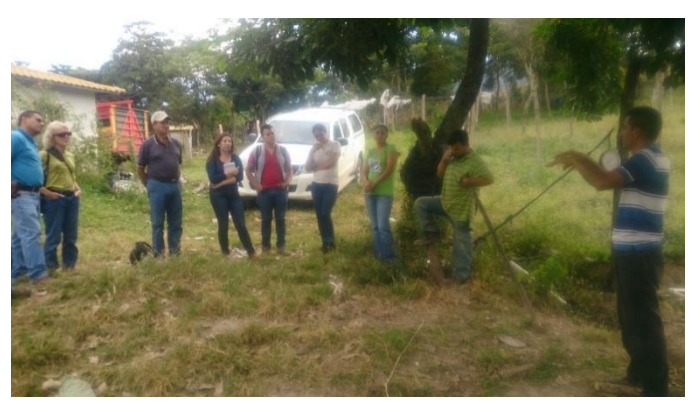
Students learn about collecting field data

focus has always been on technical (agronomic) information. Zamorano is working closely with INGENAES to develop new curricula and train faculty and students on the inclusion of gender and nutrition into existing training modules. These should be completed and piloted by mid-2017.